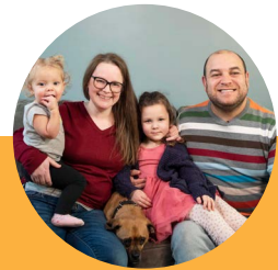
THE TAUGHRIN FAMILY