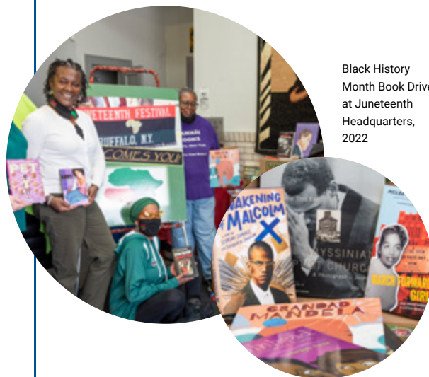
Black History Month Book Drive at Juneteenth Headquarters, 2022